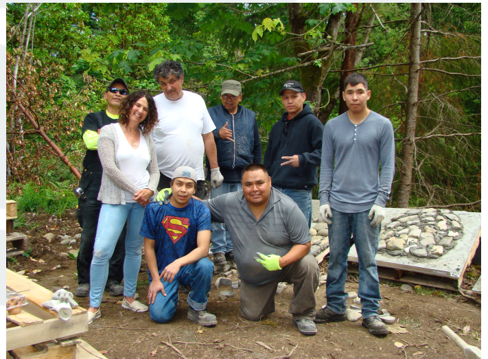
Malahat First Nation Crayfish construction crew