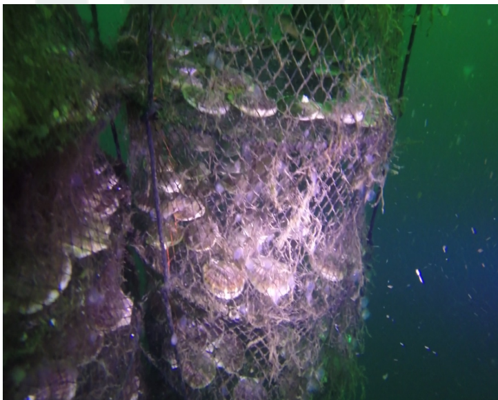
Barkley Sound Shellfish Scallops