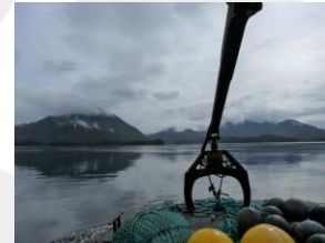
Setting-up a Scallop Farm in Toquaht Territory