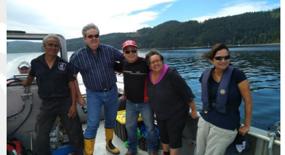
Tla'amin Nation Field Survey Crew