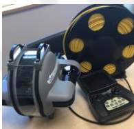
AAA's new ROV Underwater Survey Tool