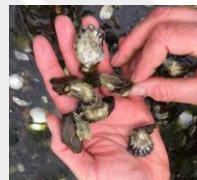
Wild Juvenile Oysters at Oclucje