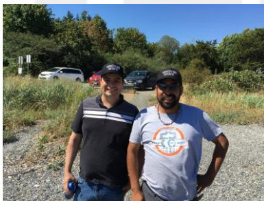
Snaw'naw'as Aquaculture Security Team

Wish You and Your Family a Merry Christmas and a Happy and Healthy New Year