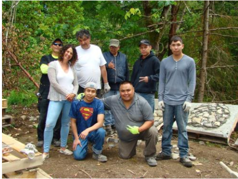
Malahat Nation Crawfish Pond Building Team